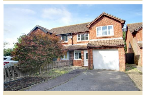
The Smithy, Denmead £395,000 – 3 Bedrooms