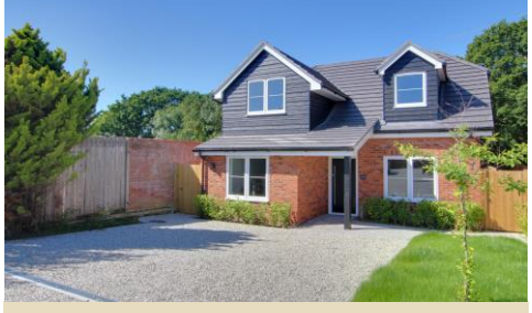
Hambledon Road, Denmead OIEO £800,000 – 4 Bedrooms