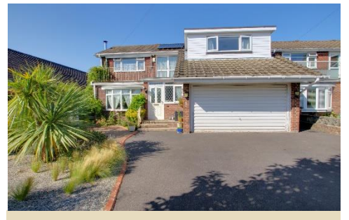
Park Road, Denmead £600,000 – 4 Bedrooms