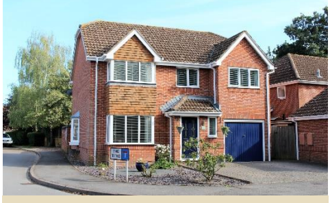
The Liberty, Denmead £485,000 – 4 Bedrooms